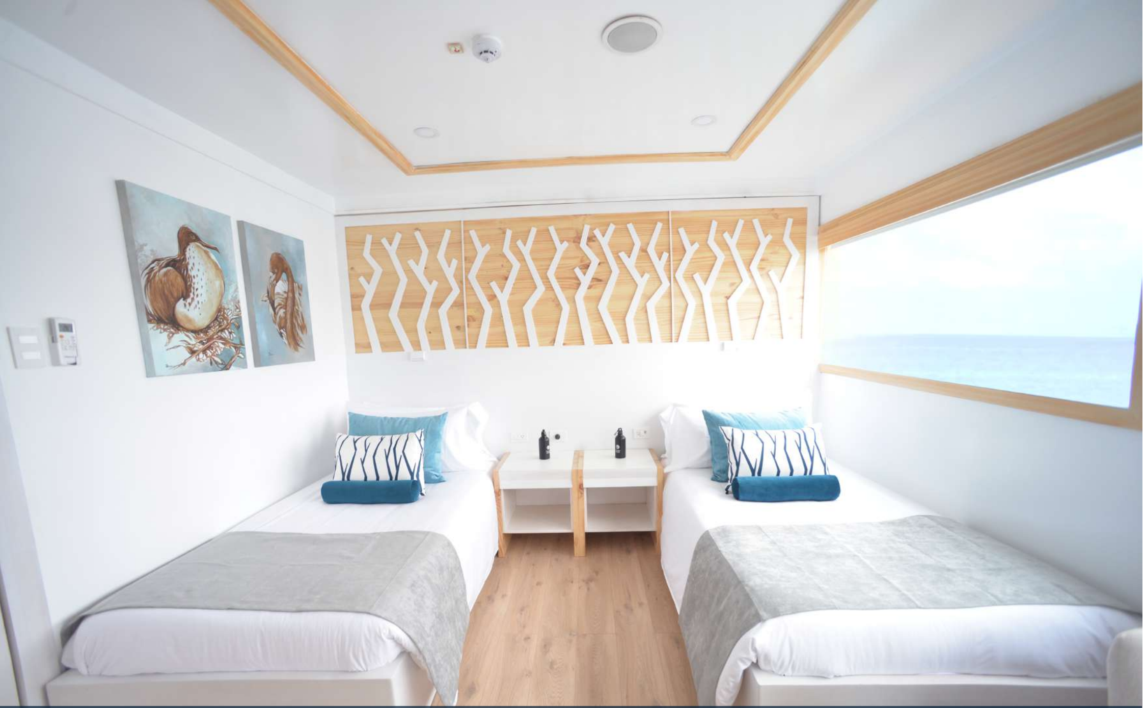
Twin Cabin Main Deck - Balcony Suite